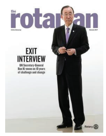
Don't miss The January Issue of THE ROTARIAN