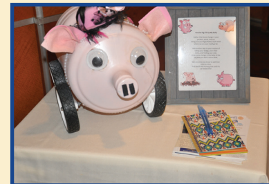
Porche Pig collects donations for the Car Show.