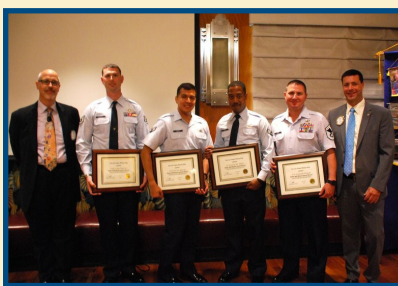
Our Q4 Wetzels Award winners.