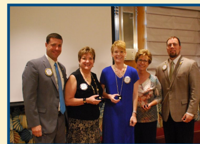
We recognize this month's Paul Harris level increase Awardees .