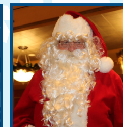
Santa joined in with Jingle Bells... Merry Christmas and we will see you next year.