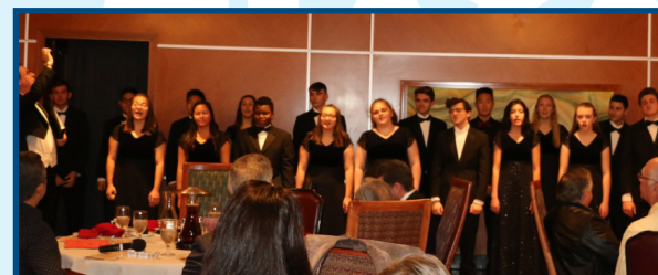
Christmas songs were presented by the Palos Verdes Choir.