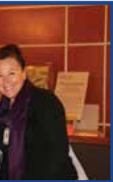
Beckley Principal discuss the success fast with Books.