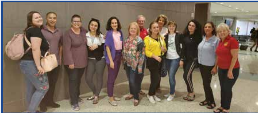
Las Vegas Rotary Club Welcomes Open World Delegates.