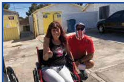
Las Vegas Rotary in partnership with the Wheelchair Foundation.