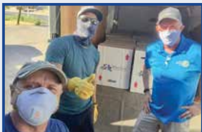
Las Vegas Rotary in partnership with the Wheelchair Foundation.