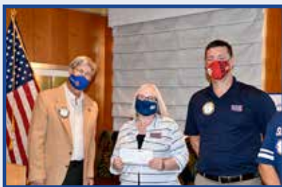
A Share What You Can check is accepted by the USO.