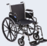
Sizes: 16", 18" and 20"