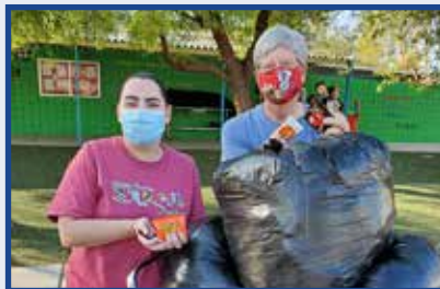
Bracken students will have a great Halloween thanks to the generosity of club members.