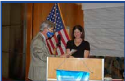
Our guest speaker receives a Share What You Can award for a great presentation.