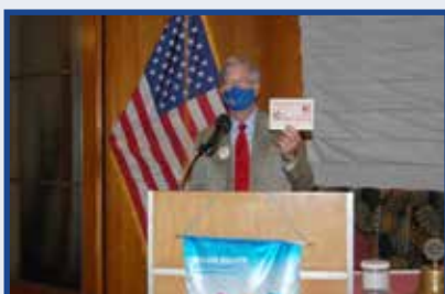
Spread the Word Nevada sent their thank you to our club for our support.