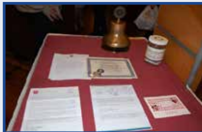
Thank you letters and awards from Spread the Word, the Salvation Army, Cristo Rey St. Viators H.S., and the Nevada Department of Veterans Services.