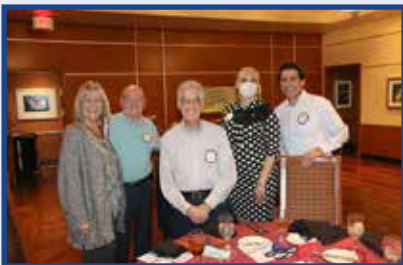
The March birthday table guests.