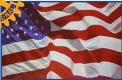
Patriotic song video.