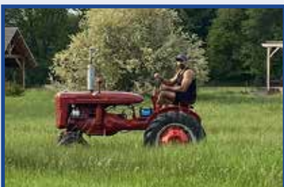
SAA Bhavan Singh is AWOL from the meeting, seen on the LVRC surveillance satellite image.