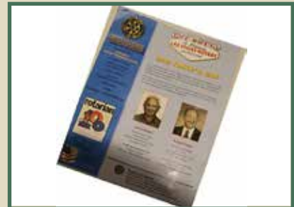
Flashback: Old Timers Day