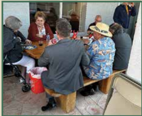
Relaxing after the 25 Club meeting