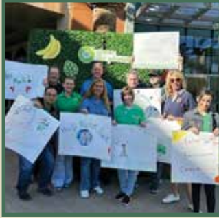
Rotarians volunteering at Green Our Planet event