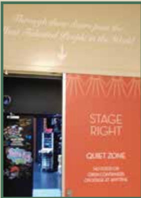
The Smith Center Tour