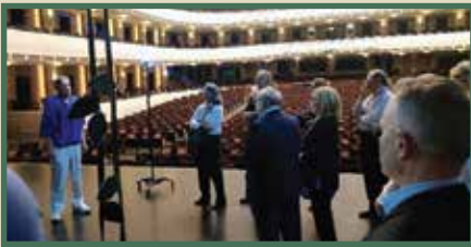
Rotarians on rare backstage tour of the Smith Center