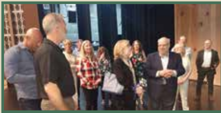
On stage at the Smith Center