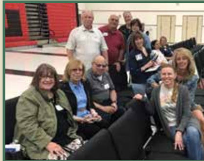
Rotarians representing LV at District Assembly in Apple Valley, CA