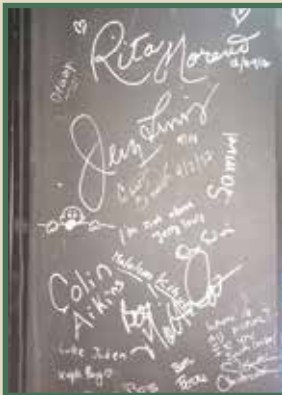
Backstage at the Smith Center