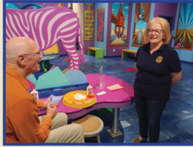
Discovery Museum Ice Cream Event on June 24