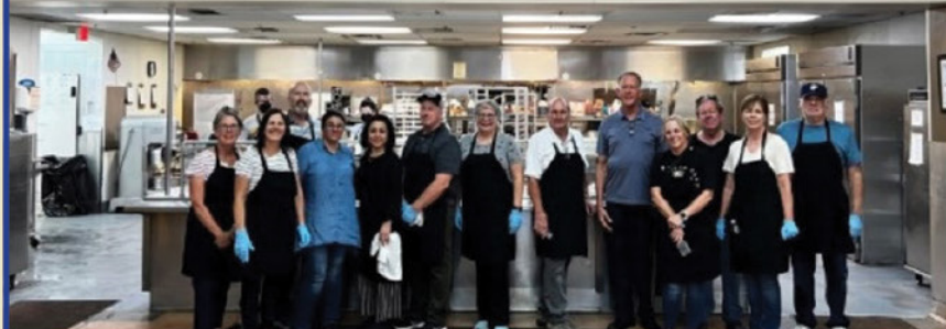
Las Vegas Mission – Las Vegas Rotary Club Serving Dinner on June 28