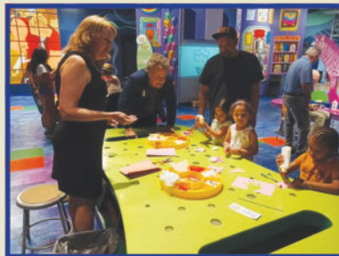
Discovery Museum Event Working the Kids on June 24