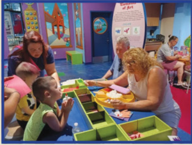
Discovery Museum Art Projects on June 24