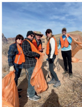
January Highway Clean Up.