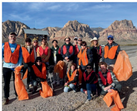
Rotarians Being Good Stewards on Our Stretch of the Highway.