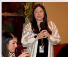
Representative From the Schools.