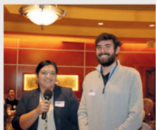
Representative From the Schools.