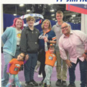
SUPER BOWL Gamero Family