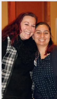
School Representatives from Beckley ES.