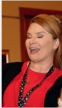
School Representatives Were in the House.