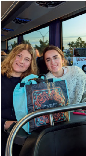
On Board and Ready to Go.