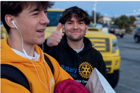
Thumbs Up and High Anticipation for a Great Weekend.