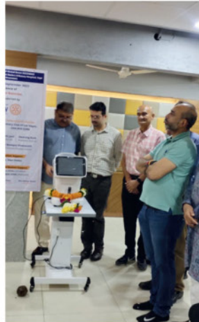
Presentation and Ceremony.