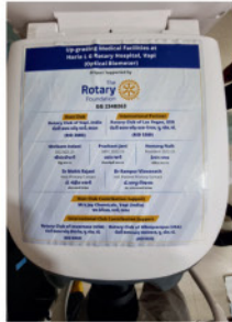
All the Partners Involved in Making this Happen including the LVRC.