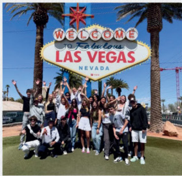
2024 RYE Students at the Las Vegas Sign