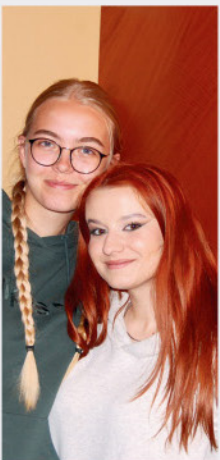
RYE Students Arrived Just in Time for Lunch Today.