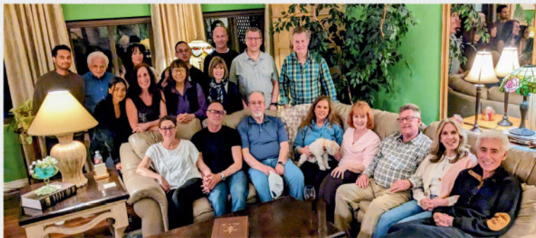
April 25 Club Meeting