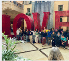
2024 RYE Students at the Love Sign