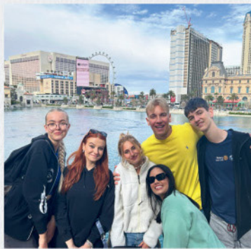
2024 RYE Students at the Bellagio