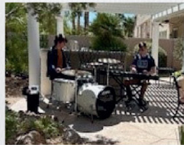
Palo Verde Duo Entertained at the Highway Clean Up Brunch