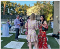
Wine to Water at Antoinette's Home.