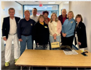
Volunteers for the Last Breakfast with Books of this School Year.