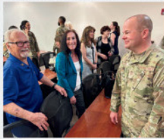
Meet & Greet at the Wetzel Awards.