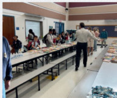
Breakfast with Books.