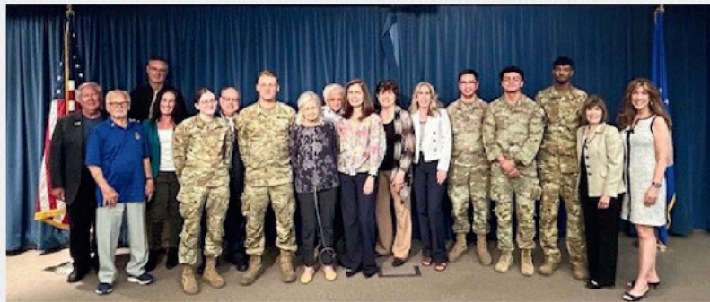
4/11/2024 Wetzel Awards