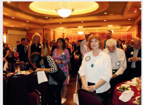
With a Packed Room at Lawry's, the Meeting Begins with an Invocation and the Pledge.