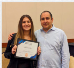
District Training Assembly. 4-Way Speech Finals.