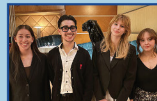
Four Way Speech Contest participants