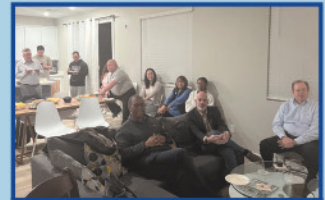
25 Club Members attending the New Member Orientation