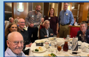
Happy March birthdays!