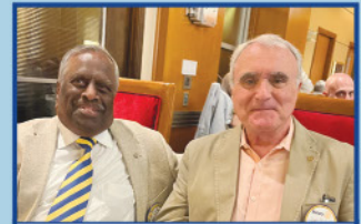
Rampur welcomes a guest