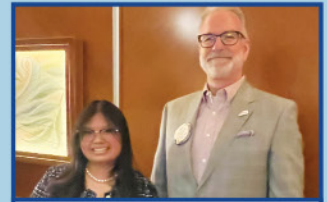
Valedictorians received a copy of the club's Centennial Book