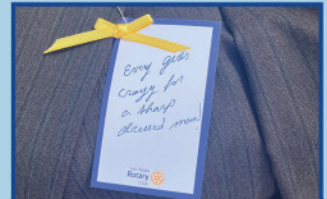
"Every girl's crazy 'bout a sharp dressed man."