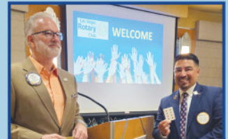
Our guest from District 5230 did NOT pull the Joker!