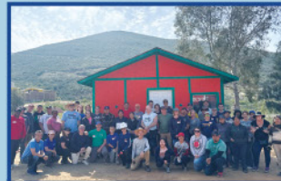
Completion of another Corazon home