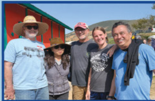
The LVRC Superbuilders