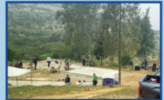
How the day got started