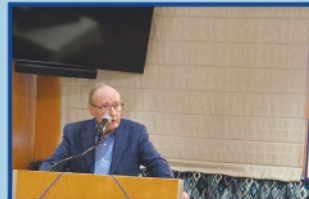
Senator Richard Bryan was our guest speaker