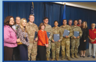
Rotarians and Wetzel Awards recipients and their colleagues