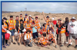
Club members and their families brave the wind to clean up Lake Mead