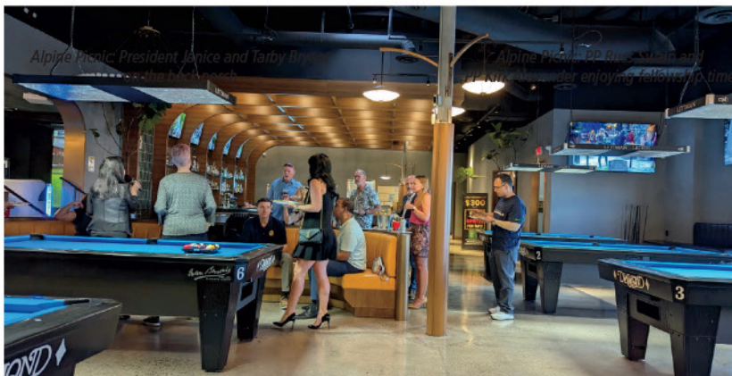
25 Club Meeting: J Bar & Golf Lounge