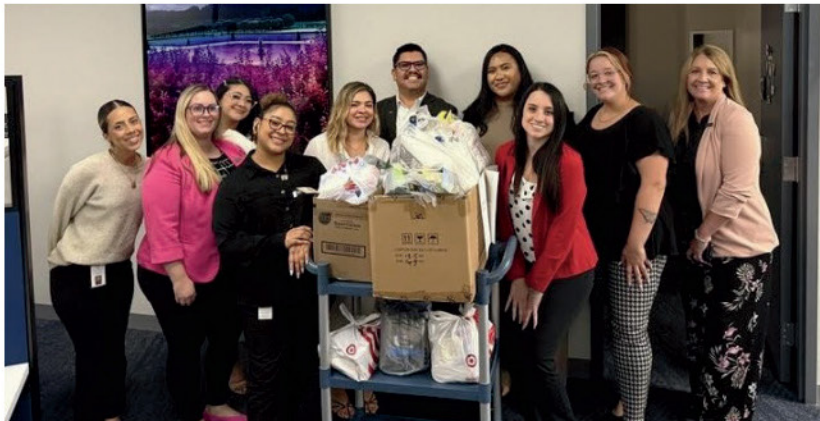
Summer Santa Clothes: Thank you to the Fontainebleau Hotel team for their donation