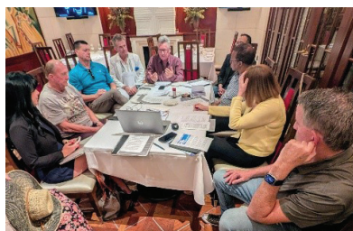
New 25 Club strategy meeting