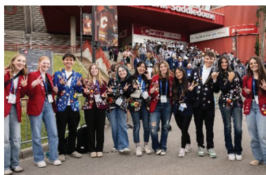
RI Convention – RYE Students