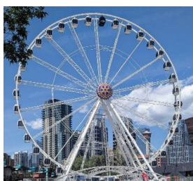
RI Convention – Giant Rotary Wheel