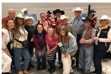
RI Convention – Host hospitality night