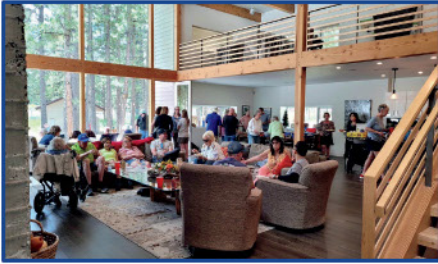
Alpine Picnic: It was a feast at Saturday's Alpine Picnic