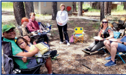
Alpine Picnic: Relaxing and smelling the pines at 71 degrees