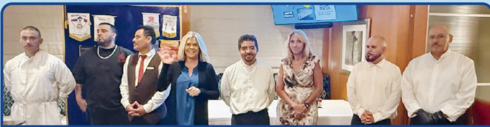
A big thank you to the staff at Lawry's