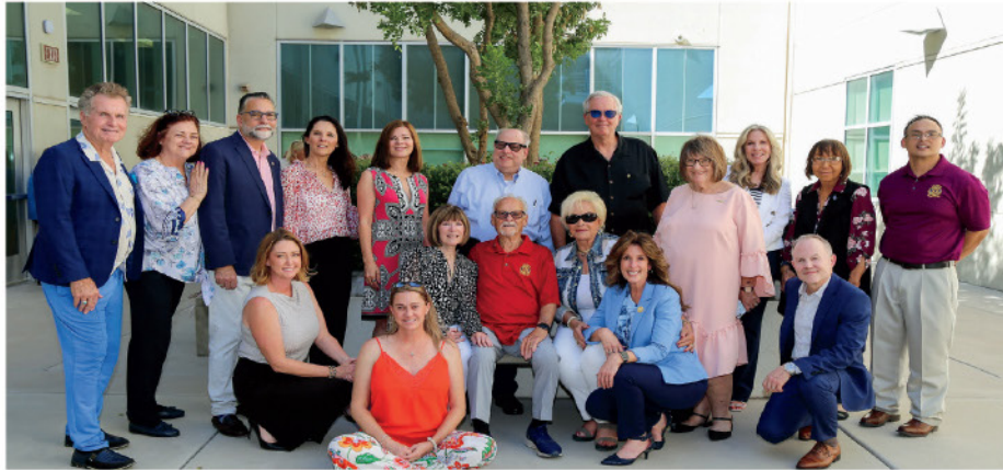
Las Vegas Rotary Club Members in attendance for the Vegas PBS Memorial Garden dedication, following a tour of Vegas PBS