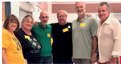
Beckley Breakfast/Snack Time with Books