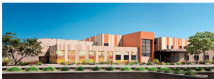
Newly built Laura Dearing Elementary School