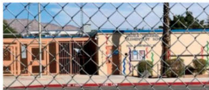
The now demolished, 60-year-old Laura Dearing Elementary School