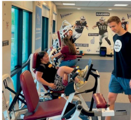
Coaching at the Ability Center at Bettys Village