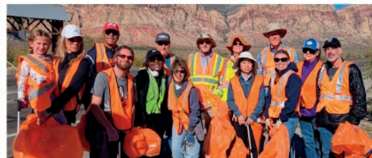
Highway Clean Up: Rumor has it 200+ cigarette butts collected!