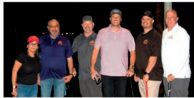
TIBERTI PUTTING: Westcare Team!