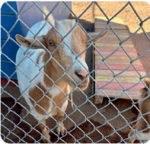
Mabel Hogarth Tour: Live farm animals