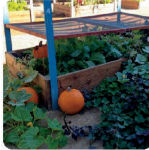
Mabel Hogarth Tour: Garden