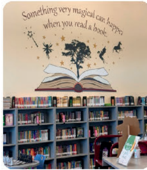
Mabel Hogarth Tour: Library