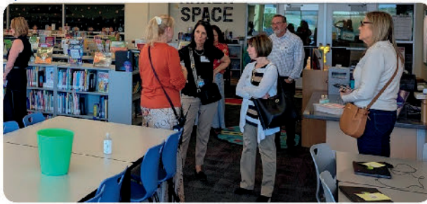
Mabel Hogarth Tour: Library