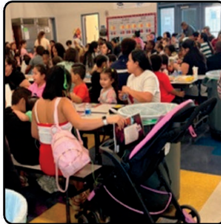
BWB: Full House at Hollingsworth