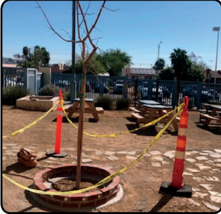
Under construction: Rotary tree well at Will Beckley