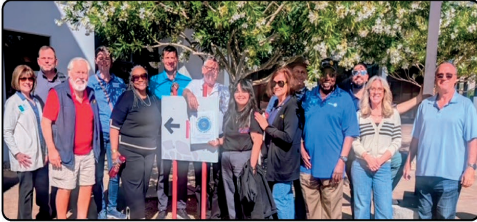
Attendees and Facilitators for the April 4 Rotary Leadership Institute