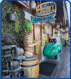
La Vecindad Mexican Restaurant