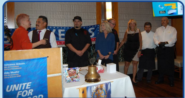
Lawry's Staff recognition