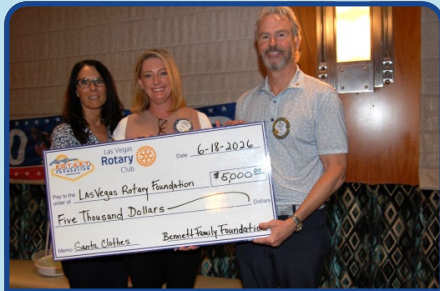
Donation to Santa Clothes from Bennett Family Foundation